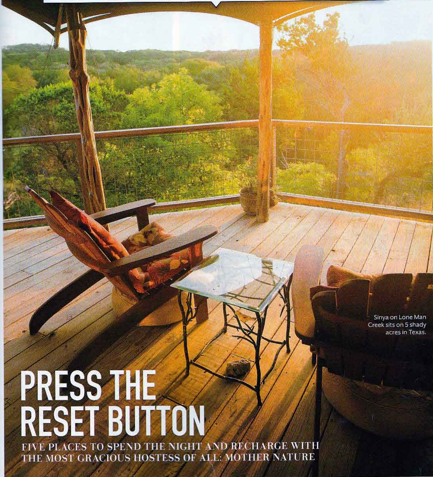
Sinya on Lone Man Creek sits on 5 shady acres in Texas.