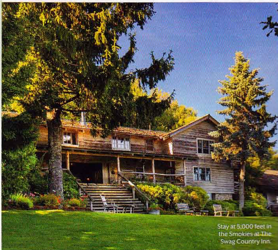
Stay at 5,000 feet in the Smokies at The Swag Country Inn.